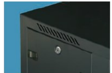
Lock for Side panel (optional)