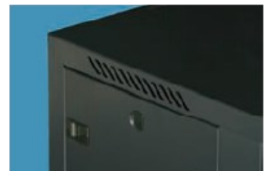
Lock for side panel(standard)