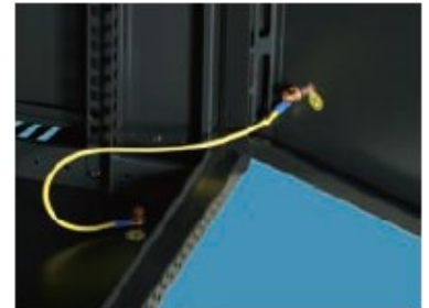
Main parts with earthing knits can connect with each other